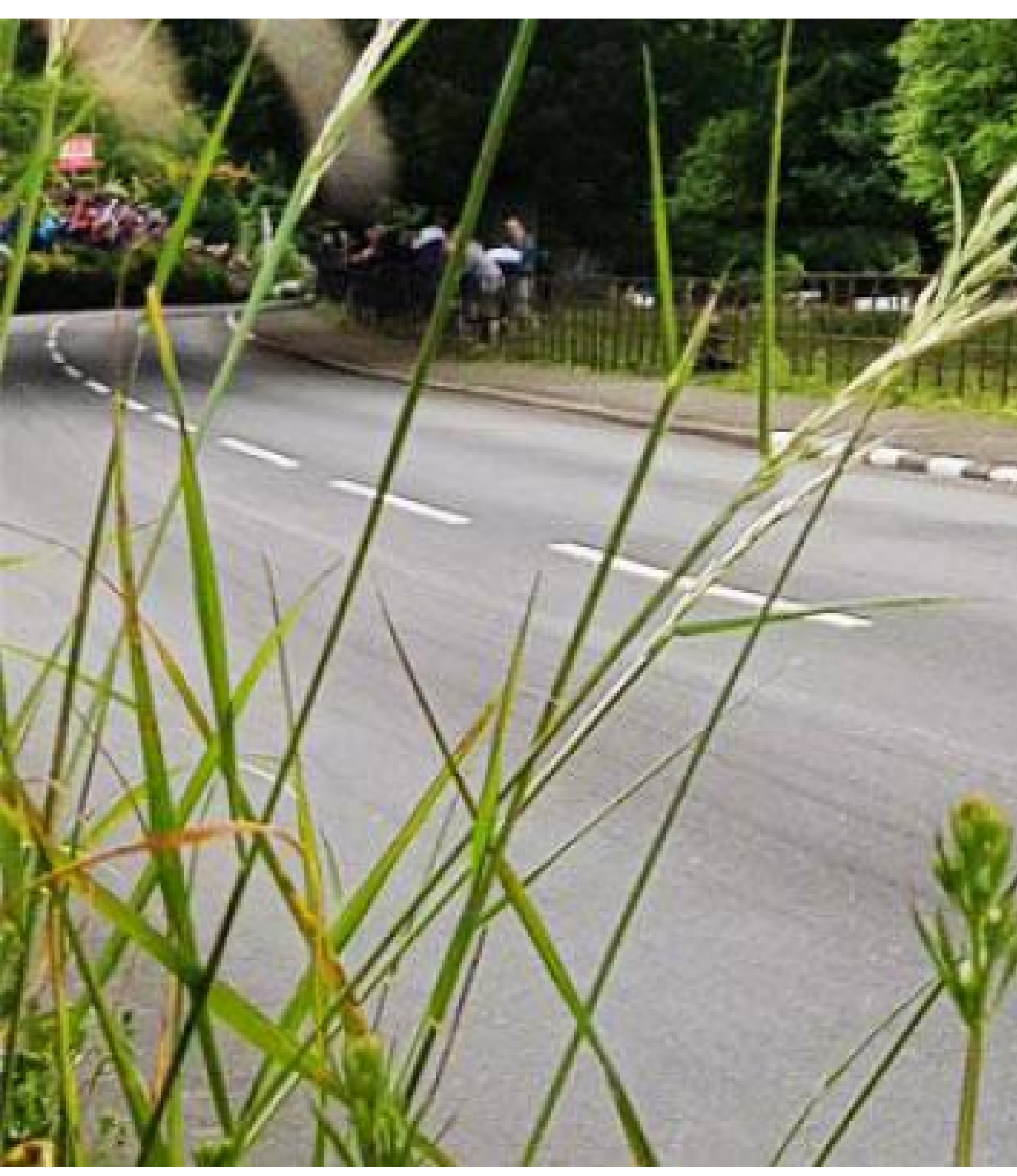
Isle of Man races TT 2025 Motorcycle Trip from Liverpool - 7-Day Short Camping