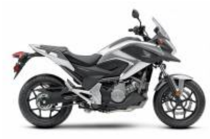
NC 750 X + $0.00