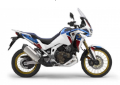
CRF1000L Africa Twin Adventure Sports + $460.64