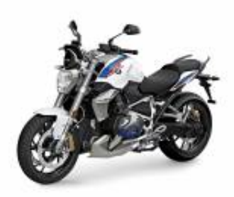
R 1250 R + $474.17