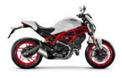
Monster 797 + $414.90