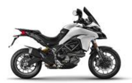
Multistrada 950 V2 + $414.90