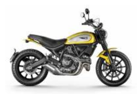
Scrambler Icon 800 + $237.08