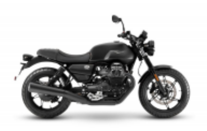
V7 Stone 800 + $0.00