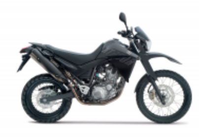
XT 660 R + R$ 4.130,11