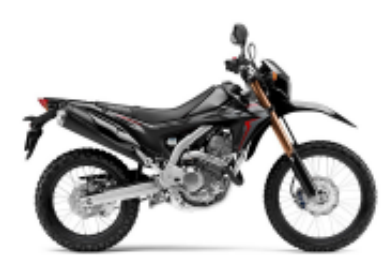
CRF 250 L + R$ 4.130,11