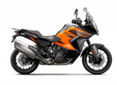
1290 Super Adventure S + $0.00