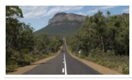
4 - Highlands - Snowy Mountains -