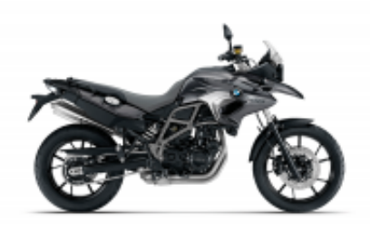
F 700 GS + $200.19