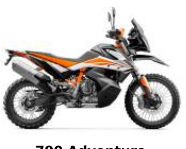
790 Adventure + $521.71