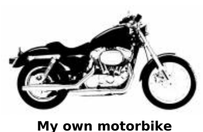
My own motorbike + $0.00