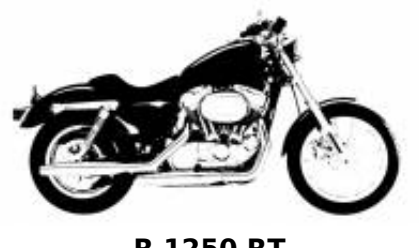
R 1250 RT + $333.89