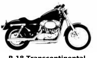
R 18 Transcontinental + $673.58