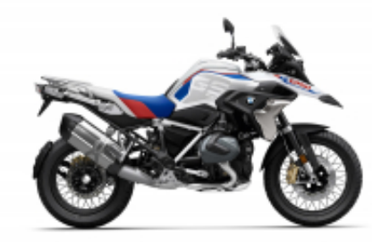
R 1250 GS + $333.89