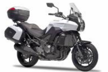
Versys 1000 Grand Tourer + $333.89