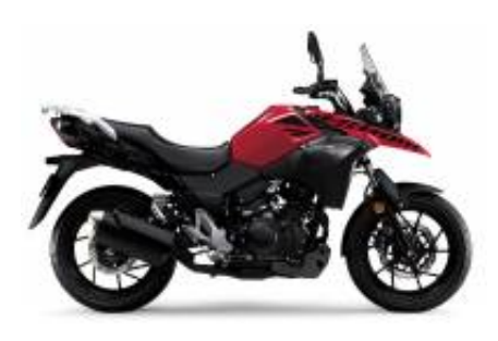
V- STROM 250 + $0.00