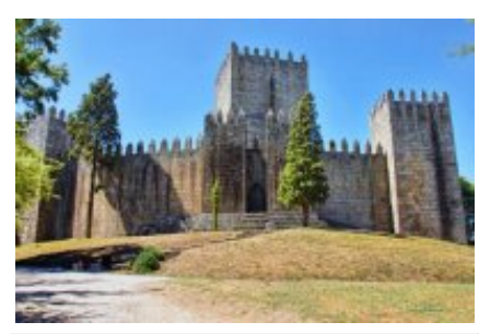
8 - Mira - Mira -

On the roads towards Mira, you will discover different towns, such as Coruche, capital of cork; Santarém, with its rice paddies and vegetable crops; and stop at Batalha, to visit the magnificent monastery of Batalha. Night in Mira.