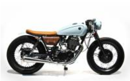
SR 250 Caferacer + 0.00.-