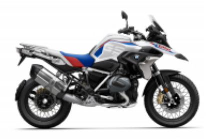
R 1250 GS + $495.70