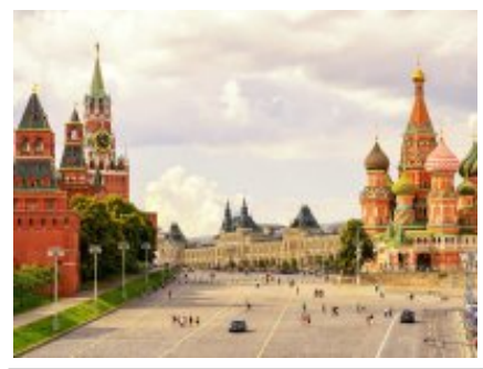
10 - Moscow - - Moscow, departure

It is our last riding day. In the morning we take a 100 km segment of the highway and after we go to secondary roads. We will finish the day in the best beer restaurant in Moscow with a farewell party!