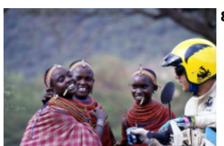
8 - Maji Moto - Nairobi - 140 km