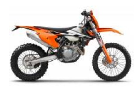
EXC 450 + £0.00