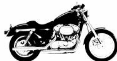
Scrambler Desert X 800 + £0.00