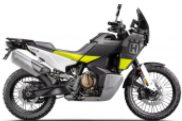
Norden 901 + £0.00