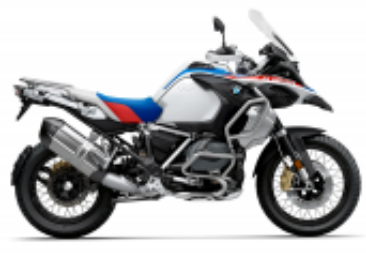
R 1250 GS Adventure + £0.00