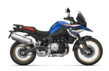
F 850 GS + 2.320,00 €