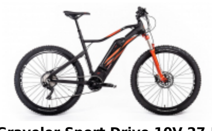
Graveler Sport Drive 10V 27,5 20.ETM.30 + $52.02