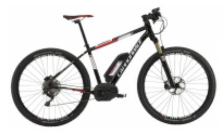
29" Tramont 2 + $70.14