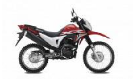
XR 190 + ¥0