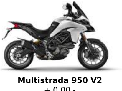
Multistrada 950 V2 + 0.00.-