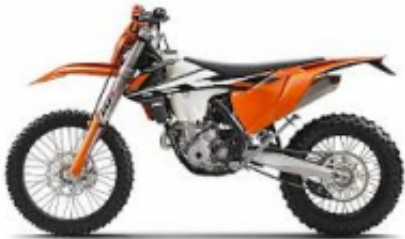
EXC 350 + £0.00

Seguro de motocicletas, piezas y equipo £25.59