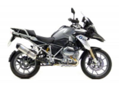
R 1200 GS LC + $832.31