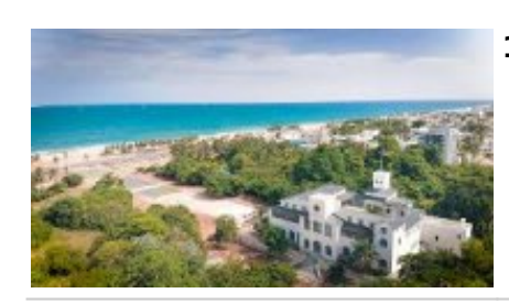
1 - - Lome - 0