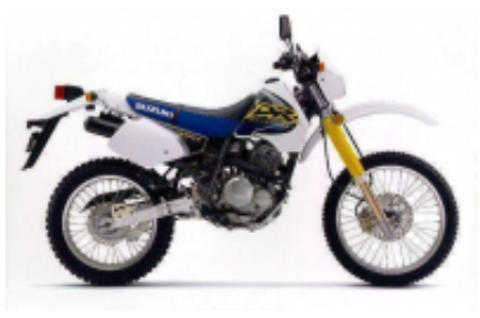
350 DR-SE + £0.00