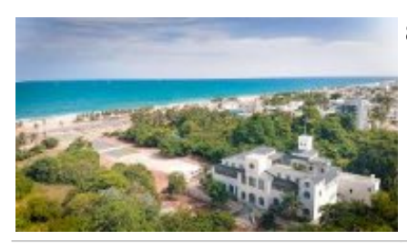
8 - Station Météorologique de Koumakonda - Lome - 180 km