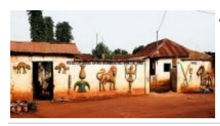
4 - Ouidah - Abomey - 170 km