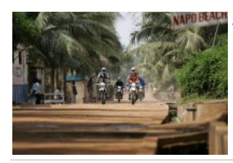
3 - Ouidah - Ouidah - 120 km