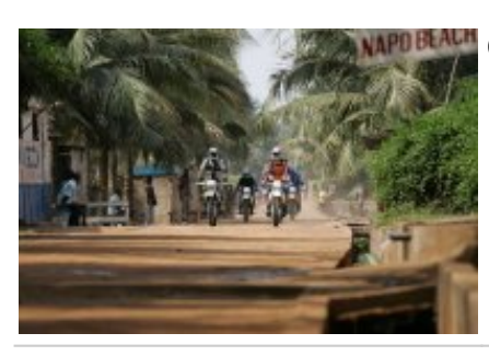
🌉 6 - Atakpame - Badou - 150 km