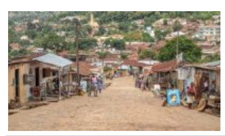
5 - Abomey - Atakpame - 150 km