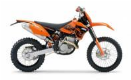
EXC 250 + R$ 3.702,99