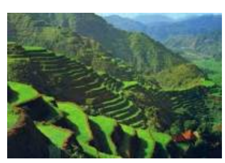
6 - - Kintamani -