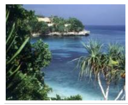
3 - Pekutatan - Negara -