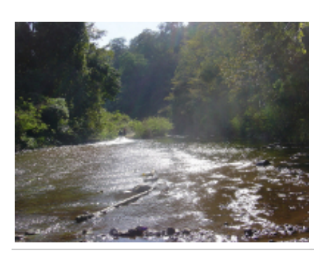
1 - - Nusa Dua -