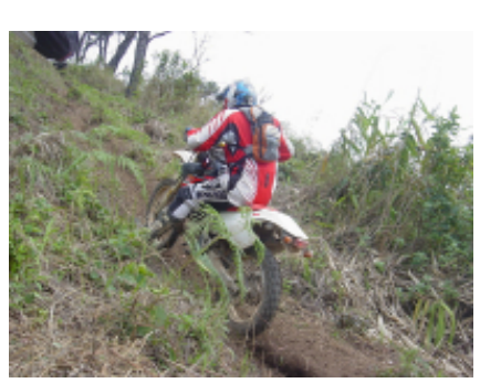
5 - Tabanan - Tabanan -