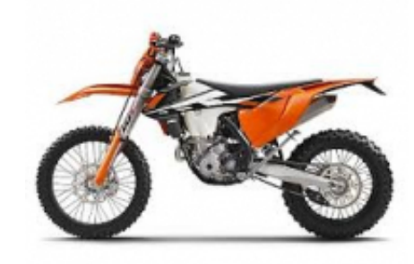
EXC 350 + R$ 3.702,99