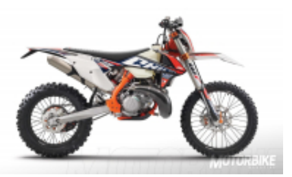
300 2T six days + R$ 3.702,99