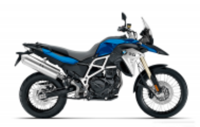
F 800 GS + $129.74