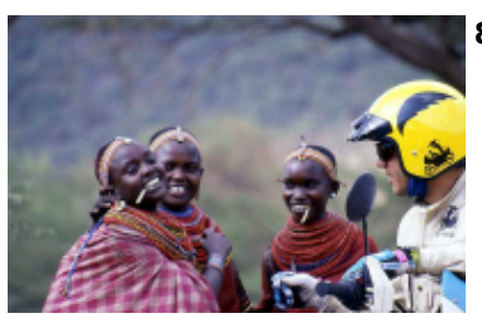
8 - Maji Moto - Nairobi - 140 km