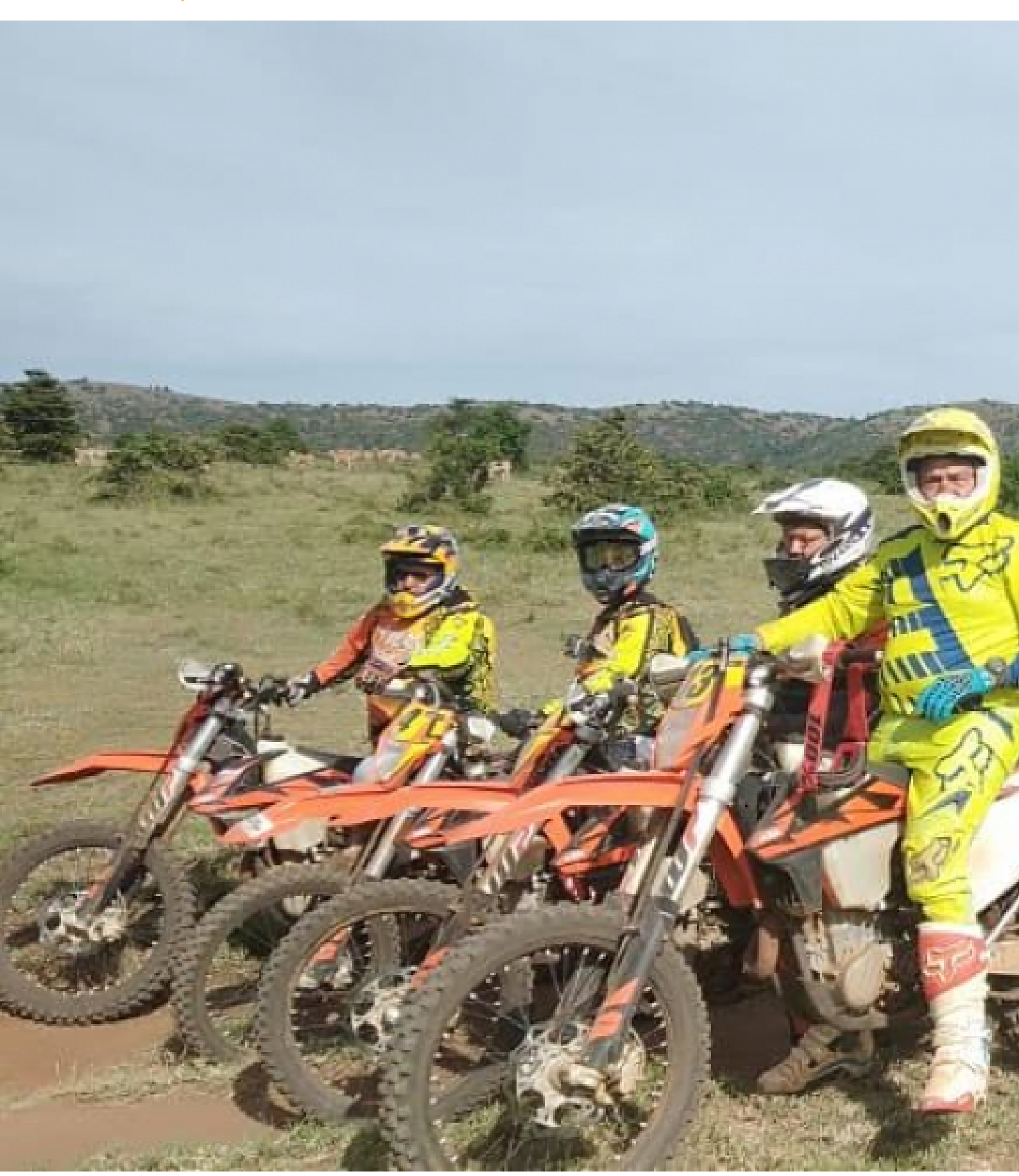
Motorcycle Enduro off Road tour Kenia Masai