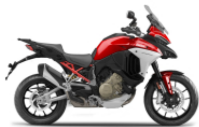
Multistrada V4 + £0.00