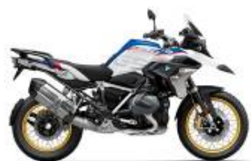
R 1250 GS HP Edition + £0.00