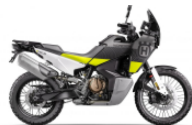
Norden 901 + £0.00