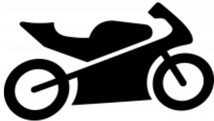
My own motorbike + R$ 0,00