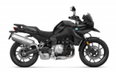
F 750 GS + $2,420.19