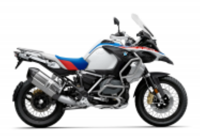
R 1250 GS Adventure + $171.84