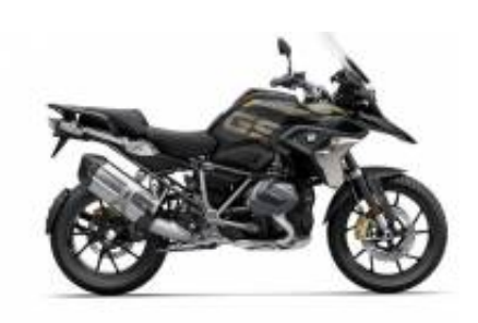
R 1250 GS LC + $2,700.00