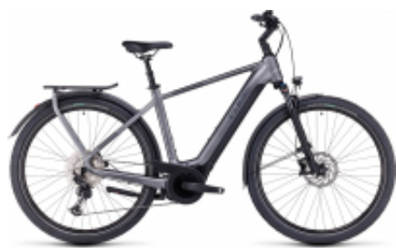
Touring Hybrid 500 One + 30,00 €

Alquiler de par de alforjas Ortieb para 9 días de ruta 25,00 €