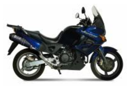
XL Varadero 1000 + $0.00