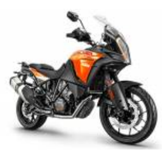
1290 Adventure S + 716.76.-