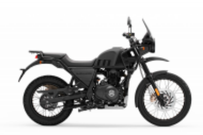
Himalayan 400 + 0.00.-