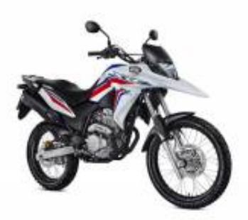
XRE 300 Rally + 0.00.-