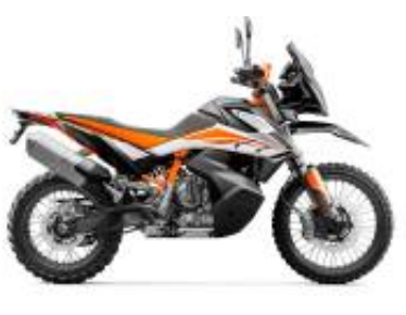
790 Adventure + $0.00