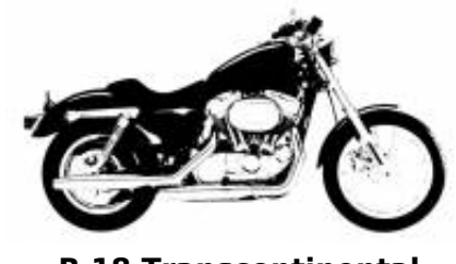
R 18 Transcontinental + $688.73