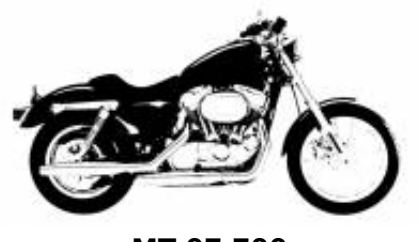
MT 07 700 + $0.00