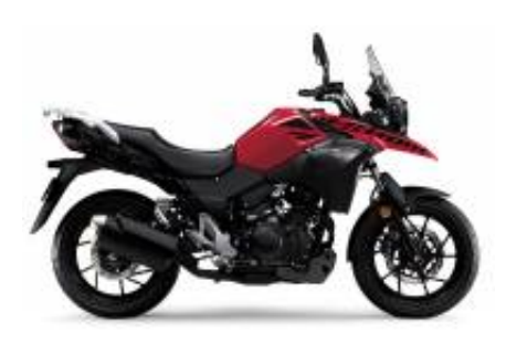
V- STROM 250 + $0.00