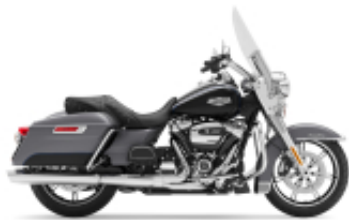
Road King Street Classic Class + £520.54