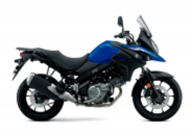
V-STROM 650 + $0.00