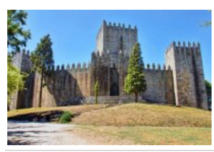
8 - Mira - Mira -

On the roads towards Mira, you will discover different towns, such as Coruche, capital of cork; Santarém, with its rice paddies and vegetable crops; and stop at Batalha, to visit the magnificent monastery of Batalha. Night in Mira.