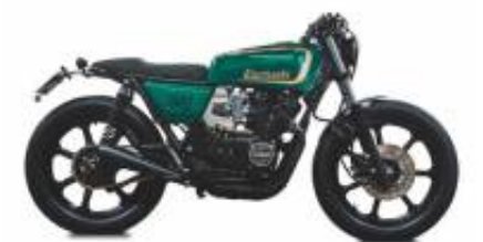
KZ550 Caferacer + $535.32