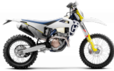
FE 350 + £0.00