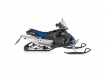
Viking 700 + $0.00