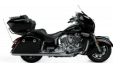
Roadmaster 1890 Grand Touring Class + 0.00.-