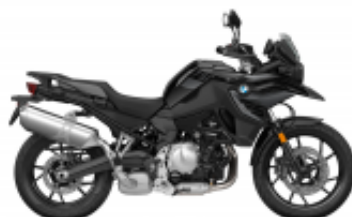
F 750 GS + 0.00.-