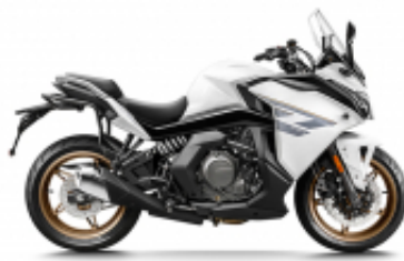
650GT + 979.53.-