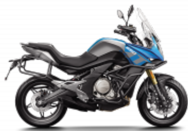
650MT 2022 + 979.53.-