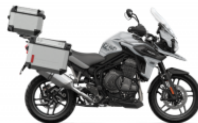
Tiger 1200 Alpine Edition + 1'871.02.-