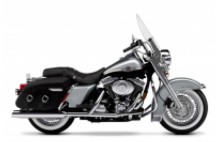
Road King + ¥0