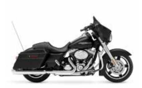
Street Glide + ¥0