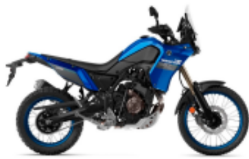
Tenere 700 + $0.00