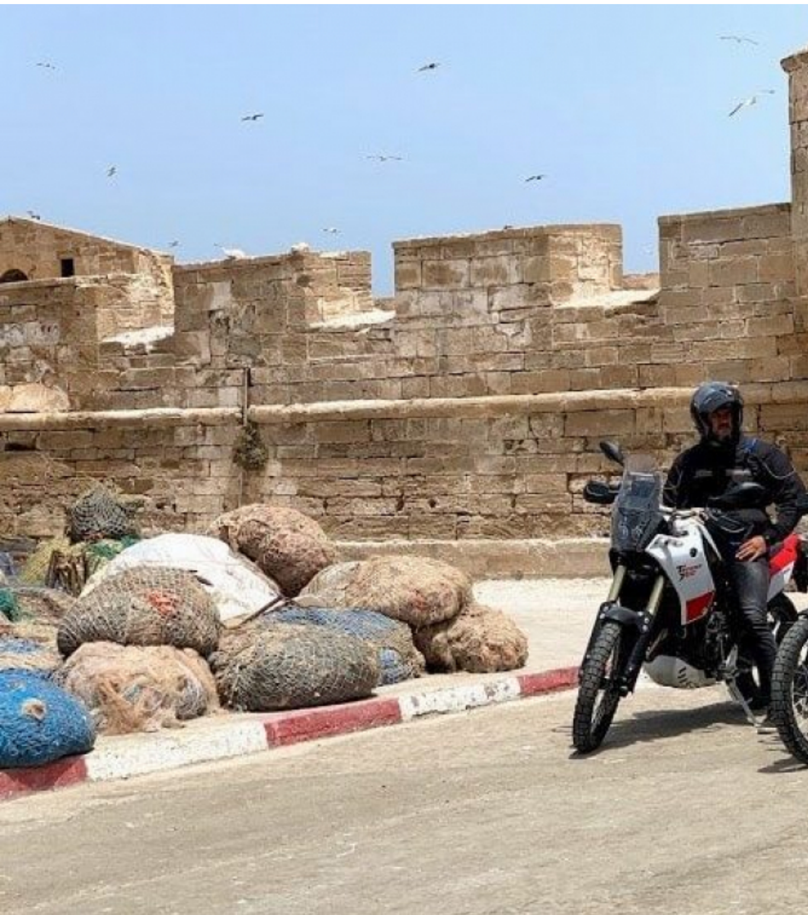
Motorcycle dual-purpose and Adventure. Morocco Road to Tafraout