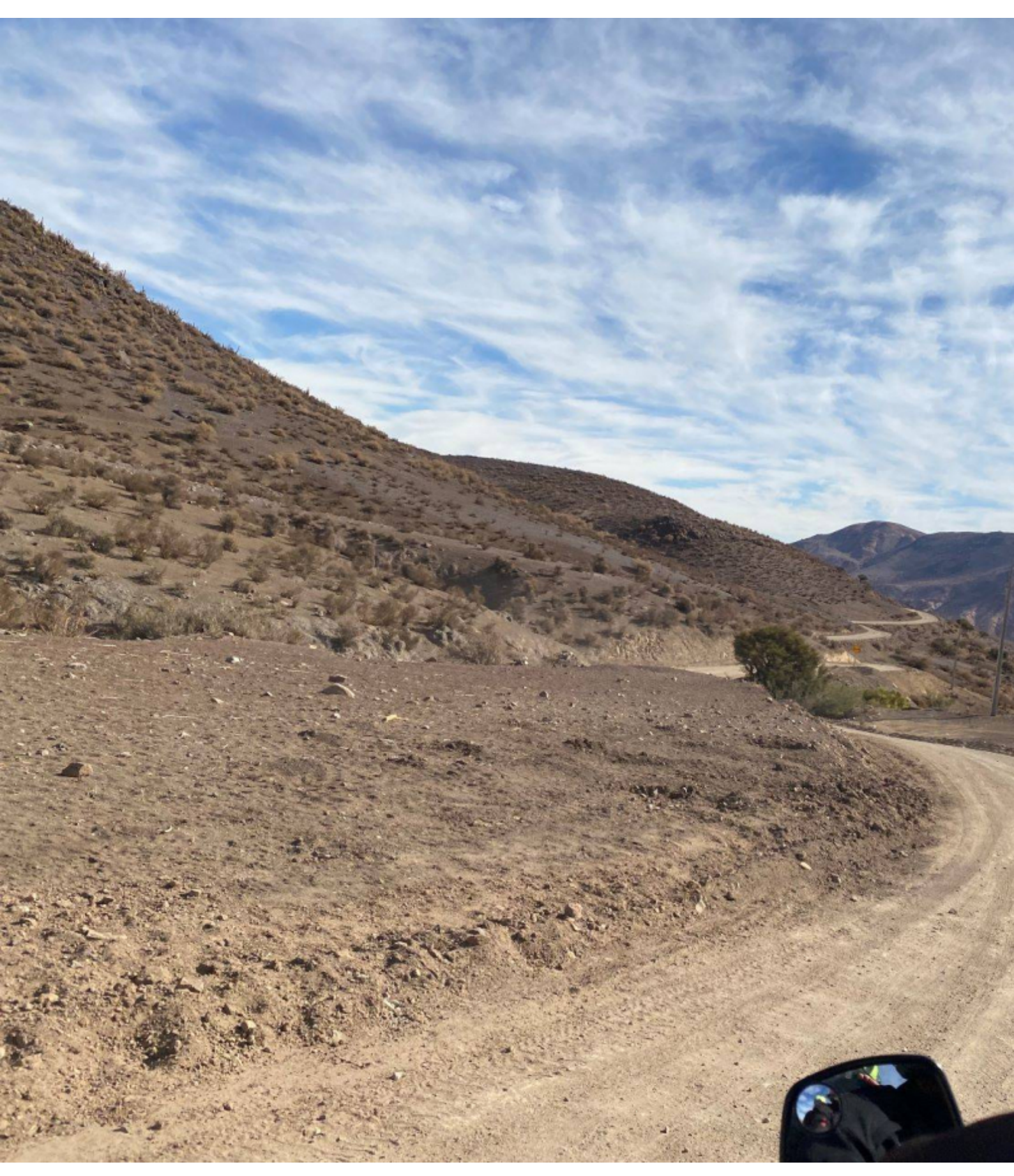
Atacama & Ruta 40